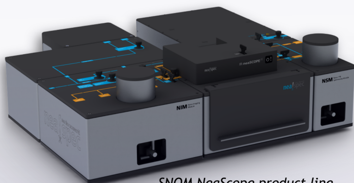
SNOM NeaScope product line

Nicolet CZ s.r.o. supplies Raman and FT-IR spectrometers and microscopes from Thermo Scientific, portable and hand-held Raman dispersive, UV-VIS-NIR and LIBS spectrometers, OEM portable Raman systems scientific Raman spectrometers from S&I, scientific infrared SNOM microscopes from Neaspec, and their accessories. We also offer custom-made analytical methods, instrument servicing, individual and group trainings, and each year we organize several Raman and Infrared spectroscopy courses, some of which are held in collaboration with Ioannes Marcus Marci Spectroscopic Society.