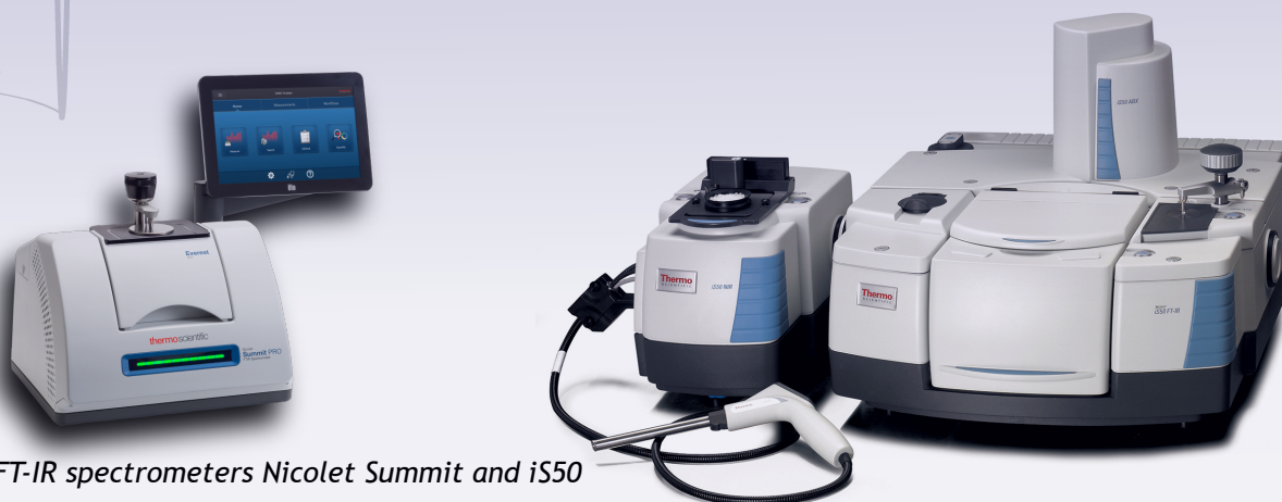
FT-IR spectrometers Nicolet Summit and iS50

Nicolet CZ s.r.o. supplies Raman and FT-IR spectrometers and microscopes from Thermo Scientific, portable and hand-held Raman dispersive, UV-VIS-NIR and LIBS spectrometers, OEM portable Raman systems scientific Raman spectrometers from S&I, scientific infrared SNOM microscopes from Neaspec, and their accessories. We also offer custom-made analytical methods, instrument servicing, individual and group trainings, and each year we organize several Raman and Infrared spectroscopy courses, some of which are held in collaboration with Ioannes Marcus Marci Spectroscopic Society.